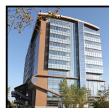
ȘCOALA NAȚIONALĂ DE STUDII POLITICE