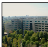
UNIVERSITATEA ROMANO AMERICANA