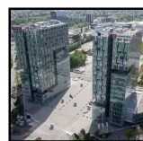
TOWER CITY GATE